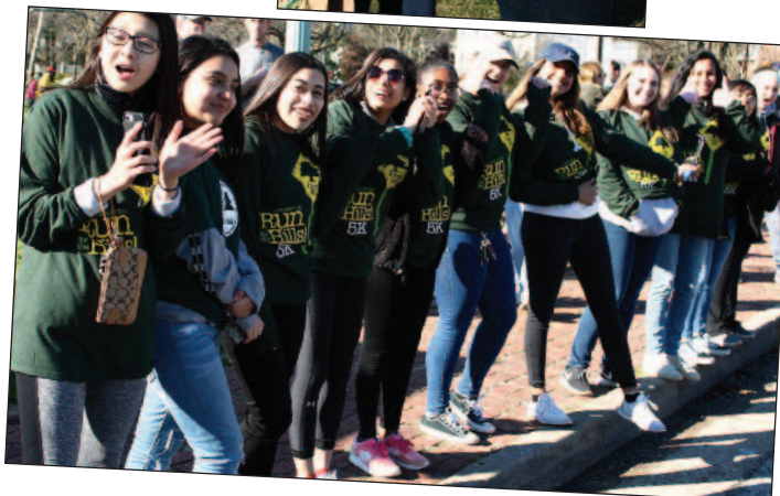
The runners were cheered on by the enthusiastic folks from the Henrico Keyettes. Thanks ladies!