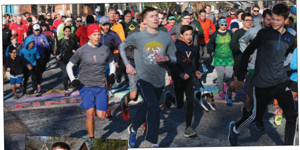
They are off!

Congratulations to all the winners and to the many participants who made this year's race a huge success. Because of you, the Forest Hill Neighborhood Association raised more than $5,000 to give back to the neighborhood through programs and events, especially Music in the Park each year. Thank you to the volunteers and the numerous folks who cheered on the runners. You made a fun run even better!