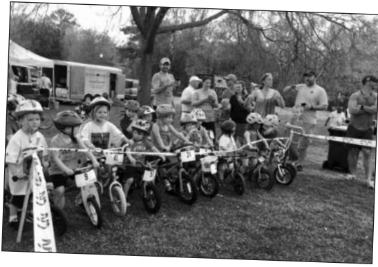
Ready, Set, Go! The youngest of the bikers line up on their strider bikes.