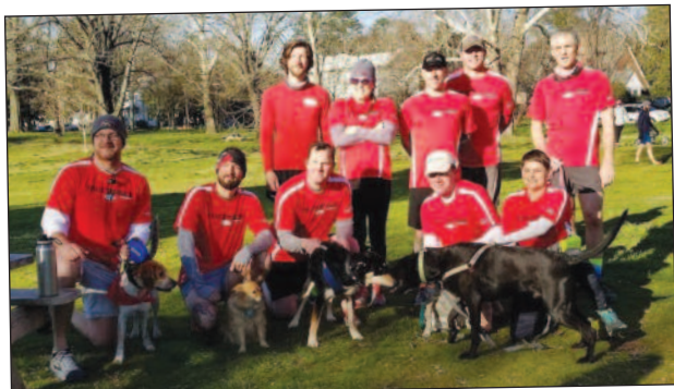
There was a large contingent from the True Timber team, both two-legged and four-legged. Thanks!