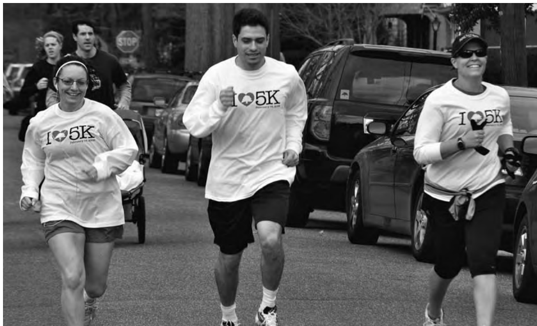
More than 230 entrants ran, strolled and walked their dogs in the inaugural running of the "I Heart Tree" 5K event. The route meandered through the neighborhood and concluded with a straight run down Spring Hill towards the finish line at the Stone House entrance to the Park. In the casual spirit of the event no times were recorded and no trophies were awarded, but every participant walked away with a souvenir t-shirt for their efforts.