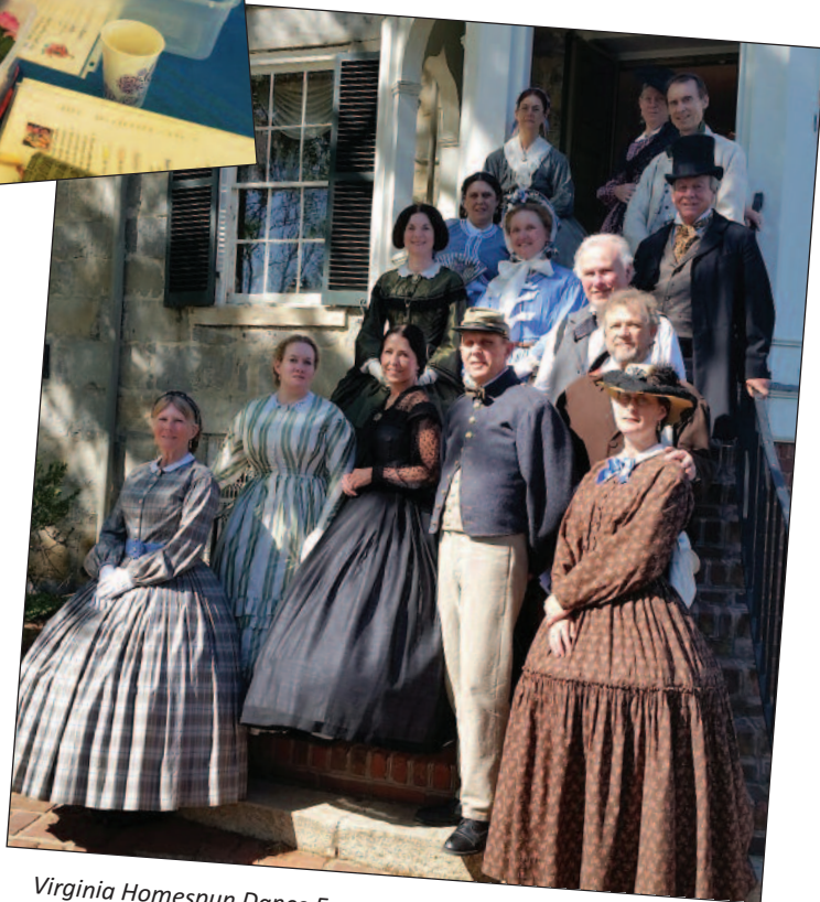
Virginia Homespun Dance Ensemble performed 19th-Century dances in the Stone House during the celebration in the park on April 24.