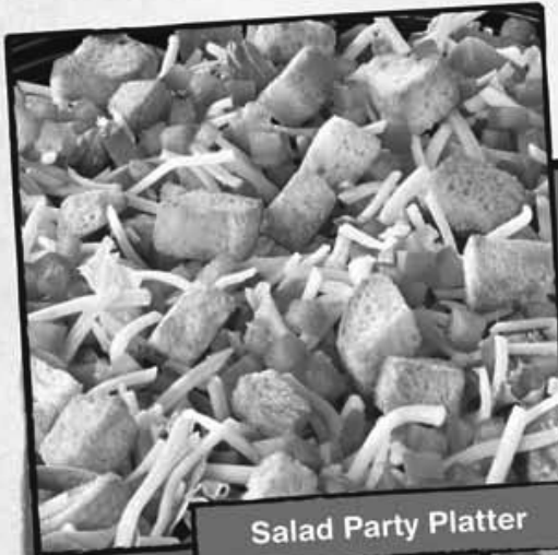
Salad Party Platter

Nothing makes a party an event quite like a Party Platter from Chili's. Call us and have fun.