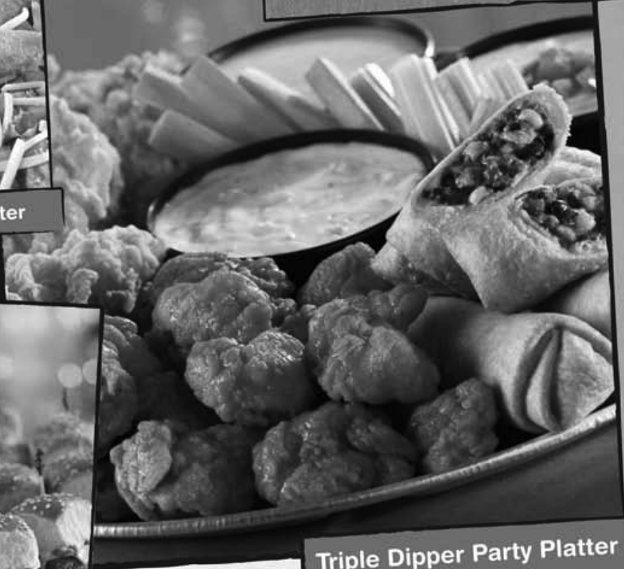
Triple Dipper Party Platter

Nothing makes a party an event quite like a Party Platter from Chili's. Call us and have fun.