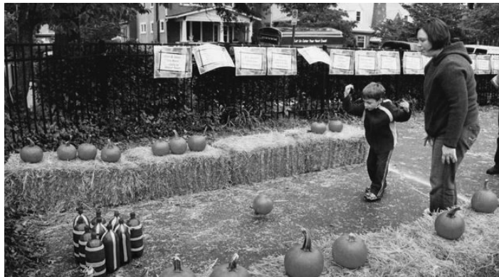
Pumpkin Bowling was a popular challenge at the 2008 Fall Festival.

The students, parents, teachers and administrators of the Good Shepherd Episcopal School cannot thank the Forest Hill Neighborhood Association enough for their collaboration and support. It was a cold day, but fun event!