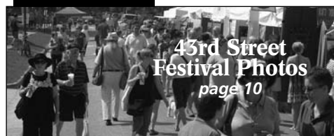
43rd Street Festival Photos page 10