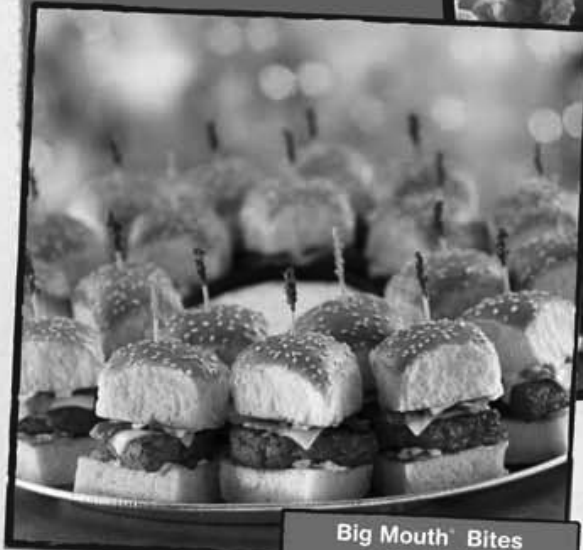
Big Mouth® Bites Party Platter

ENJOY A FREE ORDER OF CHIPS & QUESO OR ONE CHOCOLATE CHIP COOKIE MOLTEN CAKE WITH THE PURCHASE OF ANY ENTRÉE.